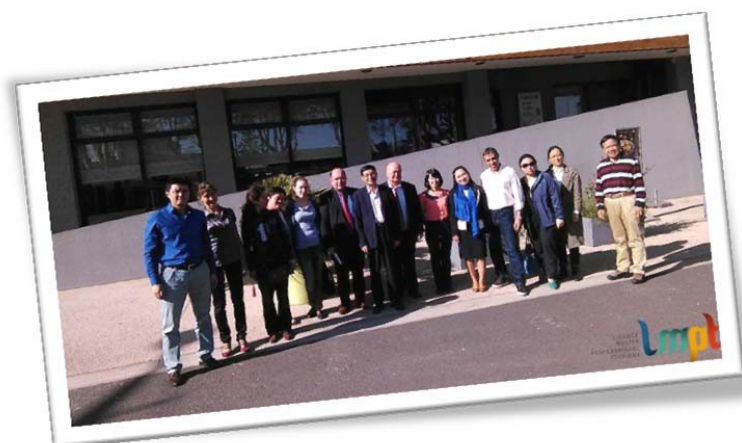
The project partners at the kick off meeting in Lyon

9 representatives of Kirghizia's universities will visit their counterparts in Greece